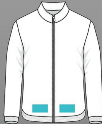
LEFT/RIGHT BOTTOM HEM HT