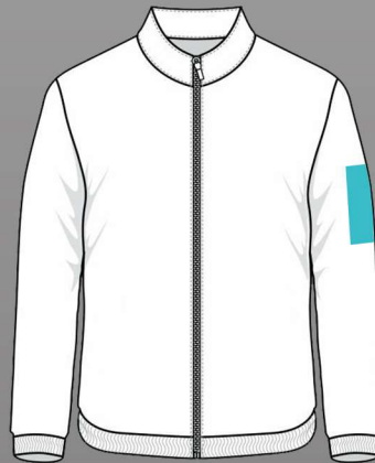
LEFT BICEP POCKET HT GL