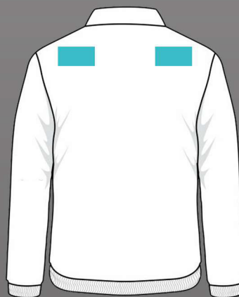
LEFT/RIGHT SHOULDER EM L