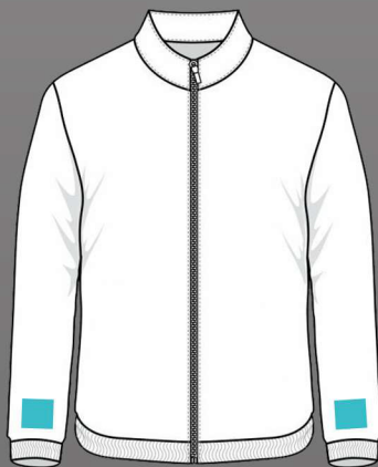
LEFT/RIGHT CUFF HT