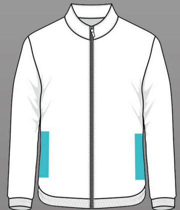
LEFT/RIGHT WAIST HT GL