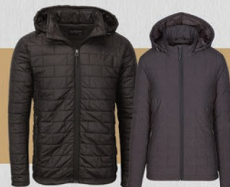
1525/1526 MICROBURST Puffer Jacket