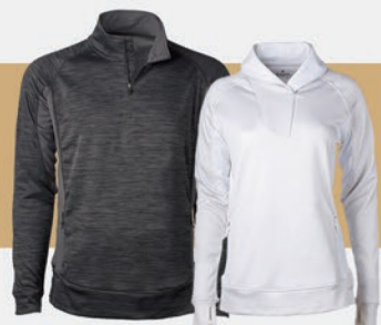
4510/4512 ORION Polyknit Pullover