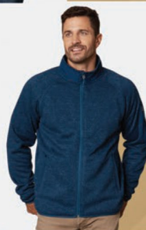
3710/3712 VILLA Sweater Fleece Jacket