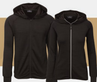
2166/2168 PARKSIDE Knit Hoodie