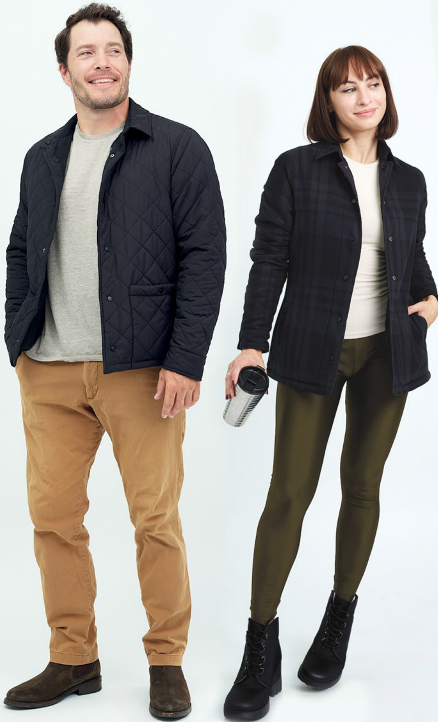
1510 MEN'S INTERIOR