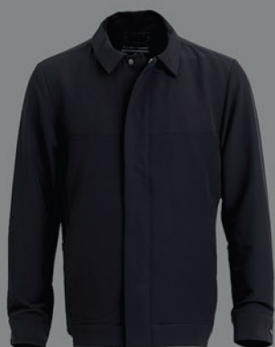
5170 MEN'S FRONT

This city inspired jacket with fold down collar has a clean and simple silhouette with thoughtful design details to set it apart from the crowd. Featuring slick shacket aesthetics and stretchy Elasti-Shell™ for all day comfort, this jacket has you covered from the conference room to the happy hour taproom, and everything in between.