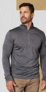
4500/4502 MIRAGE Long Sleeve Shirt