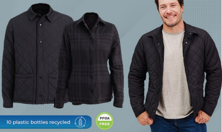
1510/1512 DIVERGE Reversible Jacket

Sustainable fashion is not just a trend, it's a way of life and commitment to being better stewards of the environment through smarter, eco conscious choices in our clothing and lifestyle.