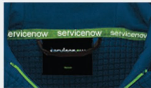
Custom Neck Taping