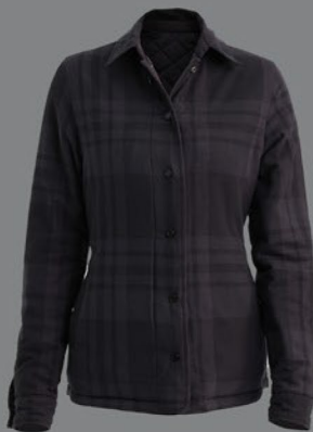
1512 LADIES INTERIOR