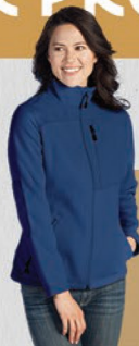
2202/2203 SEQUOIA Thermo-Fleece Jacket