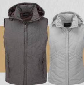
1581/1582 JUPITER Puffer Vest