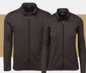
2482/2484 PROMENADE Knit Jacket