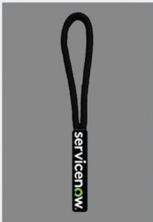
Custom Zipper Pull