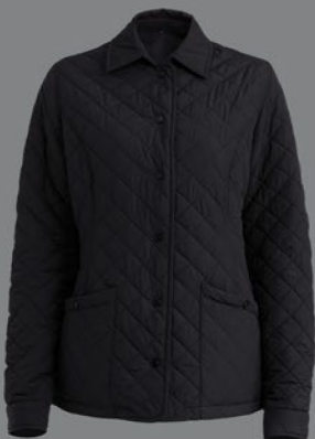
1512 LADIES EXTERIOR

A premium, insulated, reversible jacket that is brimming with style and packed with features. With a diamond quilted polyester exterior and a reversible cotton poly flannel interior, the Diverge is the ultimate 2-in-1 jacket, flip from a sophisticated urban jacket to a rugged countryside shacket in seconds.