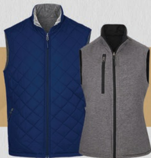
1570/1572 ADAPT Reversible Vest

Stocked with a wide variety of popular soft shells, trending puffer pieces, and luxurious bombers, Fossa is proud to be recognized in this industry as stylish and reliable. Ready for any project of any size, we are here to drive your potential projects to the finish line.