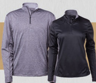
4480/4482 CERRADO Knit Pullover