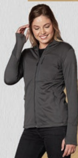
2268/2269 MESA Fleece Jacket