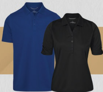
4900/4902 MONTEREY Wicking Polo