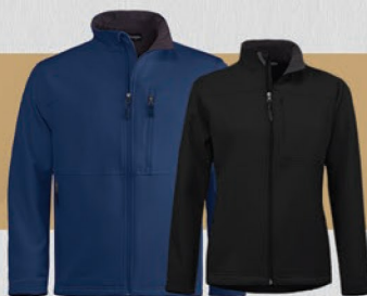
5558/5578 DOWNTOWN Soft Shell Jacket