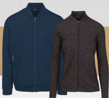
2950/2952 MORPHEUS Knit Jacket