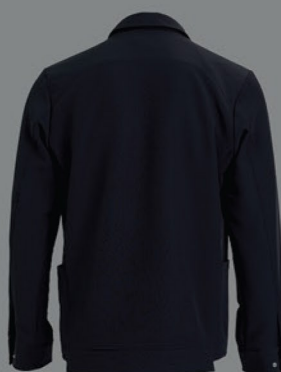
5170 MEN'S BACK