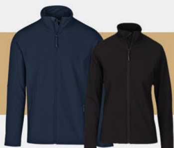
5505/5506 NEXUS Soft Shell Jacket