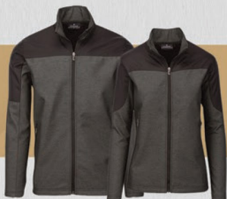
5500/5502 ASPECT Soft Shell Jacket