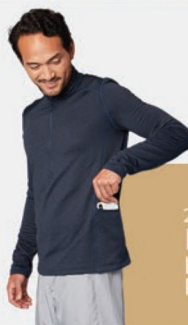
2170/2172 LAGUNA Lightweight Pullover