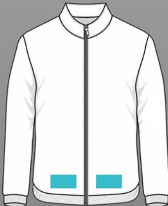
LEFT/RIGHT BOTTOM HEM