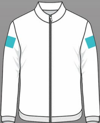
LEFT/RIGHT BICEP EM HT