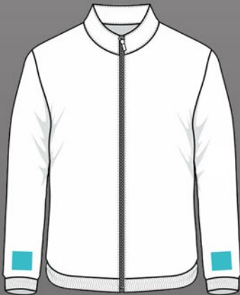
LEFT/RIGHT CUFF HT