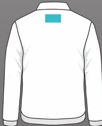
BACK YOKE EM HT