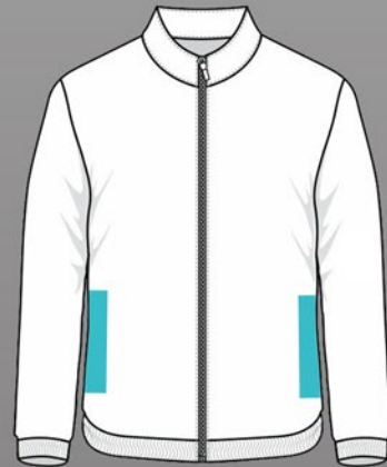
LEFT/RIGHT WAIST HT