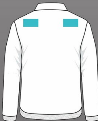
LEFT/RIGHT SHOULDER EM