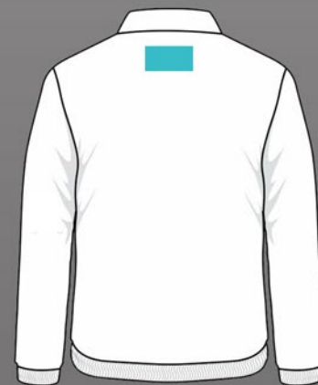
BACK YOKE EM