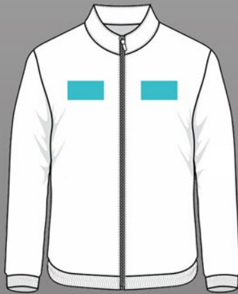
LEFT/RIGHT CHEST EM

Clothing illustrations for depicting decoration locations only, not accurate representation of any specific product.