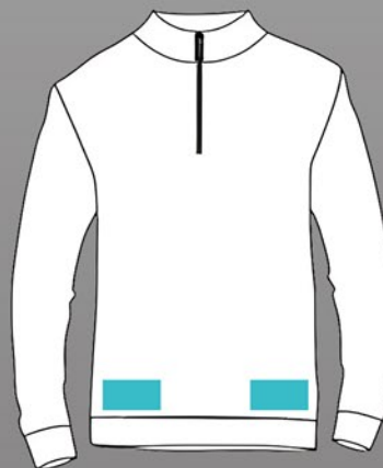
LEFT/RIGHT BOTTOM HEM HT