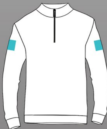
LEFT/RIGHT BICEP EM HT