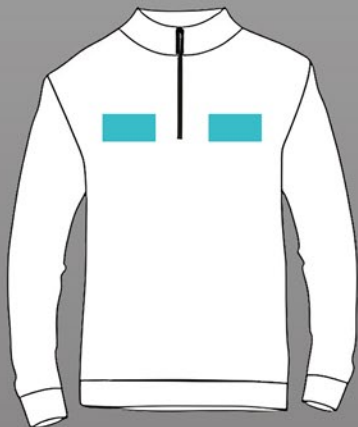
LEFT/RIGHT CHEST EM HT

Clothing illustrations for depicting decoration locations only, not accurate representation of any specific product.