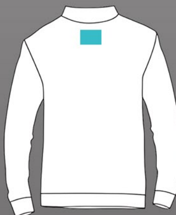
BACK YOKE EM HT