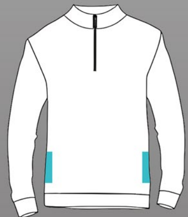
LEFT/RIGHT WAIST HT