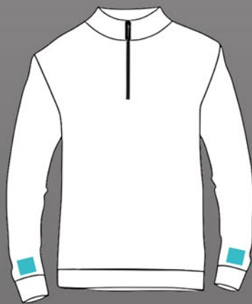
LEFT/RIGHT CUFF HT