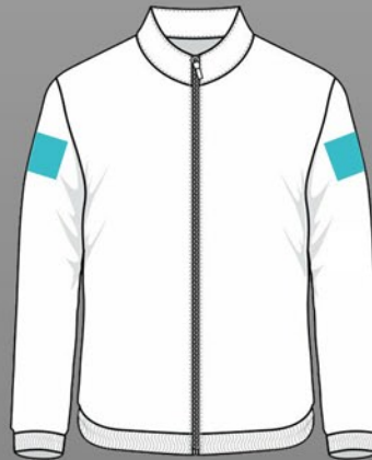
LEFT/RIGHT BICEP EM