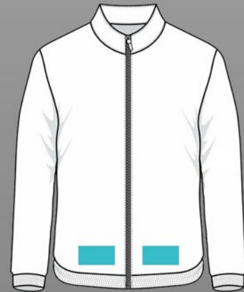
LEFT/RIGHT BOTTOM HEM HT