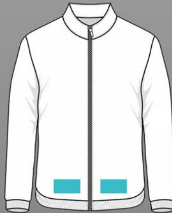
LEFT/RIGHT BOTTOM HEM HT