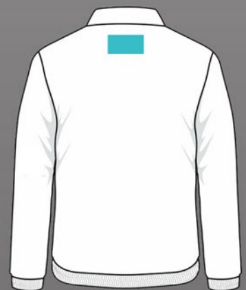
BACK YOKE EM HT