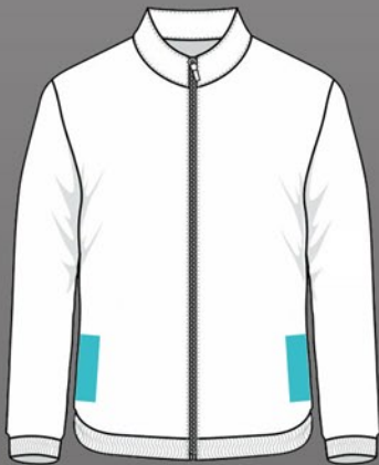
LEFT/RIGHT WAIST HT