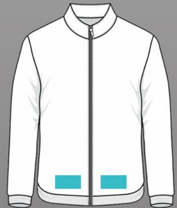
LEFT/RIGHT BOTTOM HEM HT