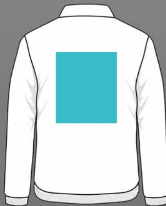
FULL BACK EM HT