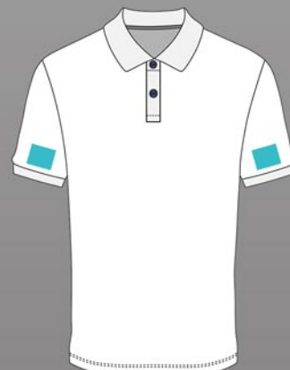
LEFT/RIGHT CUFF EM HT GL