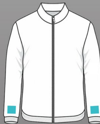
LEFT/RIGHT CUFF HT L GL