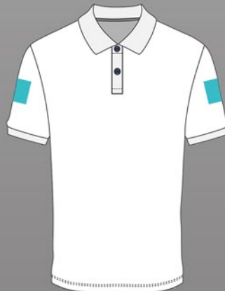
LEFT/RIGHT BICEP EM