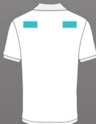
LEFT/RIGHT SHOULDER EM