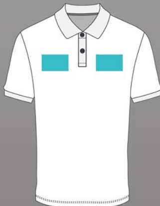
LEFT/RIGHT CHEST EM

Clothing illustrations for depicting decoration locations only, not accurate representation of any specific product.