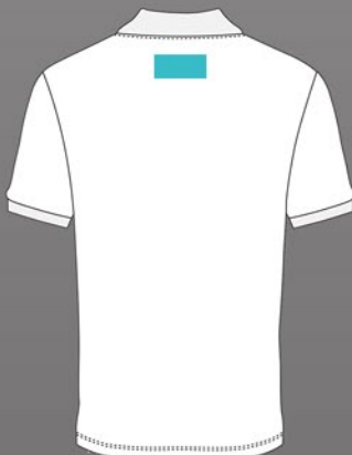
BACK YOKE EM