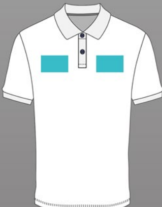
LEFT/RIGHT CHEST EM

Clothing illustrations for depicting decoration locations only, not accurate representation of any specific product.