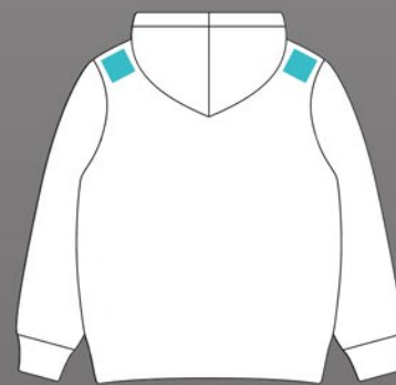
LEFT/RIGHT SHOULDER EM HT GL