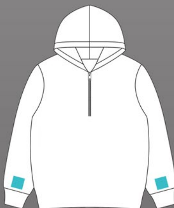
LEFT/RIGHT CUFF HT GL