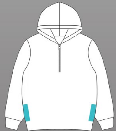
LEFT/RIGHT WAIST HT GL