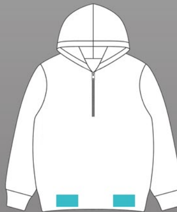
LEFT/RIGHT BOTTOM HEM HT GL