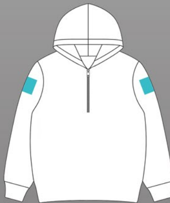
LEFT/RIGHT BICEP EM HT GL