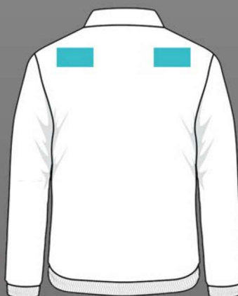
LEFT/RIGHT SHOULDER EM