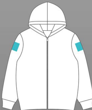
LEFT/RIGHT BICEP EM HT