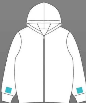
LEFT/RIGHT CUFF HT