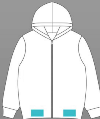
LEFT/RIGHT BOTTOM HEM HT