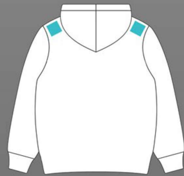
LEFT/RIGHT SHOULDER EM HT