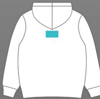
BACK YOKE EM HT