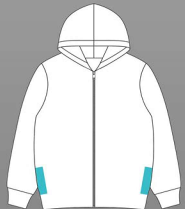
LEFT/RIGHT WAIST HT