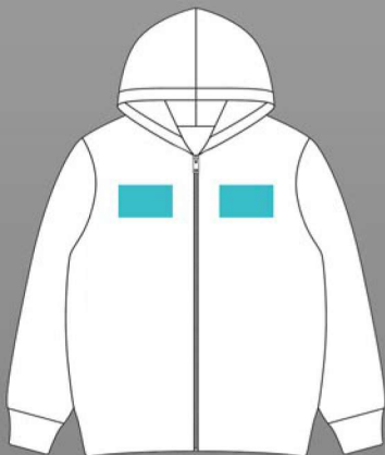
LEFT/RIGHT CHEST EM HT

Clothing illustrations for depicting decoration locations only, not accurate representation of any specific product.