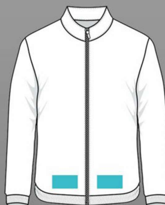
LEFT/RIGHT BOTTOM HEM HT