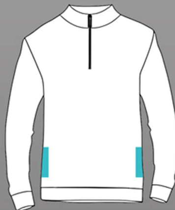
LEFT/RIGHT WAIST HT