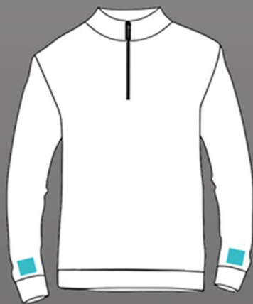
LEFT/RIGHT CUFF HT