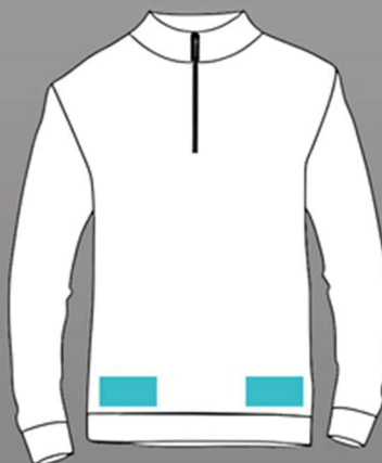
LEFT/RIGHT BOTTOM HEM HT