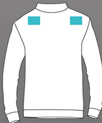
LEFT/RIGHT SHOULDER EM HT