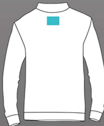
BACK YOKE EM HT