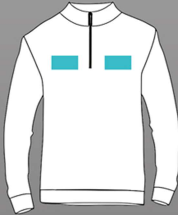
LEFT/RIGHT CHEST EM HT

Clothing illustrations for depicting decoration locations only, not accurate representation of any specific product.