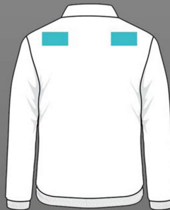
LEFT/RIGHT SHOULDER EM HT L GL