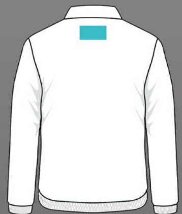
BACK YOKE EM HT L GL