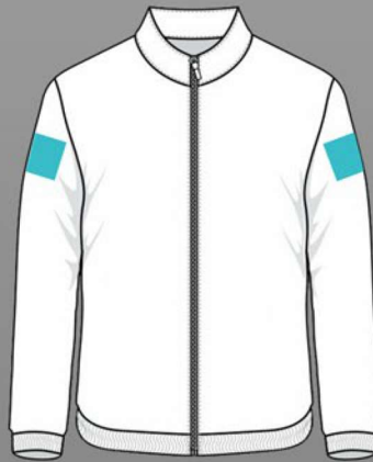
LEFT/RIGHT BICEP EM HT L GL