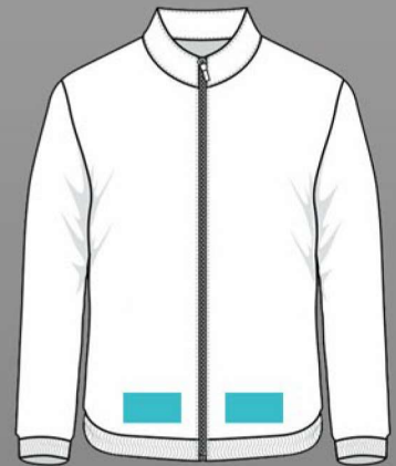
LEFT/RIGHT BOTTOM HEM HT L GL