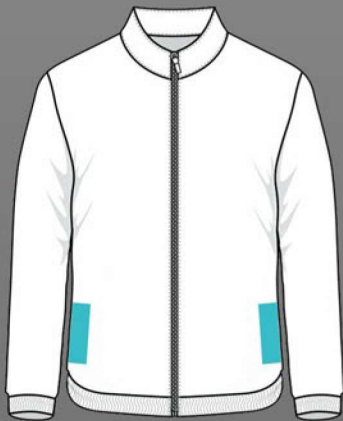
LEFT/RIGHT WAIST HT L GL