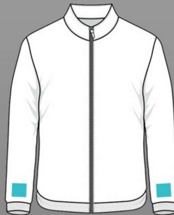
LEFT/RIGHT CUFF HT L GL