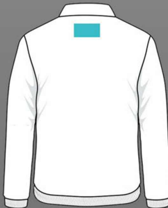
BACK YOKE EM HT