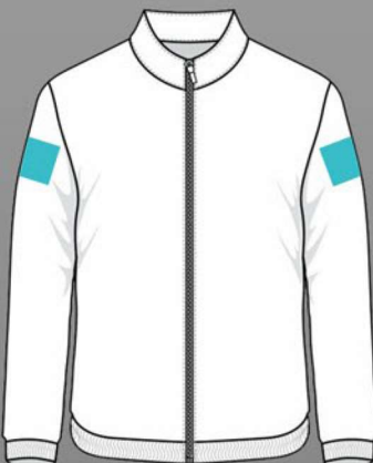
LEFT/RIGHT BICEP EM HT